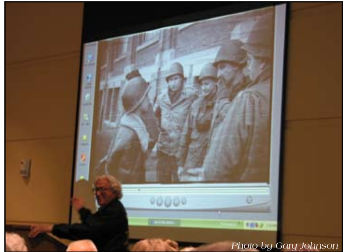
Combat photographer Tony Vaccaro presented his retrospective called "Across the Elbe River with the Thunderbolt Division" during the AHEC-hosted reunion of the 83 rd Infantry Division. Mr. Vaccaro donated his photographs to the USAHEC.