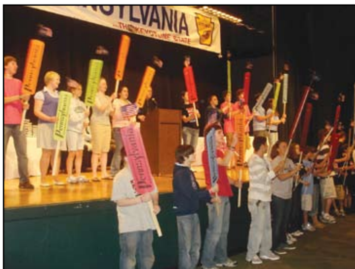
Students at the 2008 State Competition Pep Rally

For the second year, the Foundation will sponsor National History Day in Pennsylvania. Over 4,000 Pennsylvania students in grades 6 through 12 participated in 2008 with 800 of these students advancing to the Foundation-sponsored state contest in May at Millersville University. This year's theme is "The Individual in History: Actions and Legacies." Regional contests begin in March, and the state contest will be May 7 and 8 again at Millersville University. Volunteers to help with logistics and to judge the students' entries are needed.