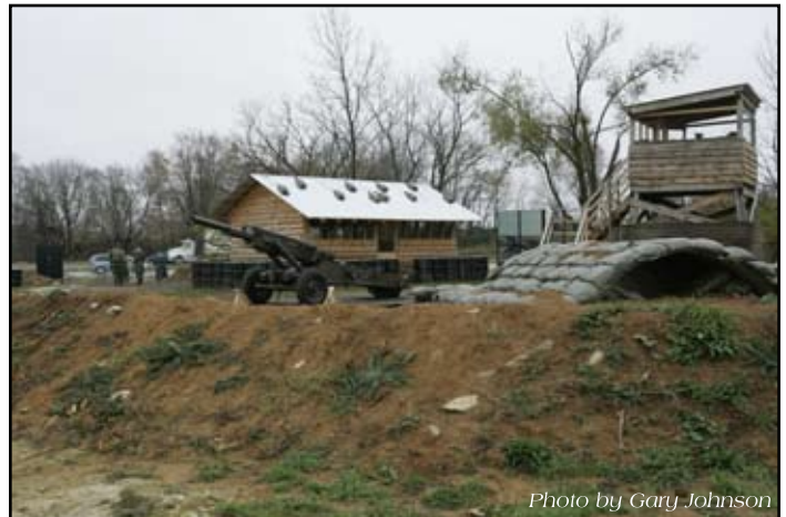
"The Vietnam Experience"