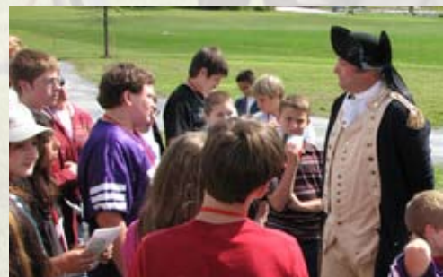
Market at Washingtonburg