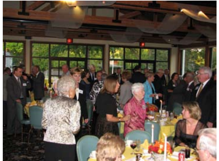
First Annual Membership Dinner

in Boiling Springs, PA. More than 150 members and guests attended this first dinner. Senator Chuck Hagel provided the meeting's keynote address from a remote location because the banking crisis and pending legislation prevented his attendance at the dinner.