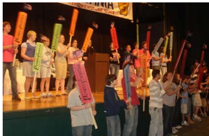
National History Day in PA Competition

In 2008, the Foundation's Education Department continued to build relationships with other educational partners. In its largest effort to date, in May 2008 the Education Department staff brought more than 800 Pennsylvania students in grades 6 through 12 with their teachers and supporting family members to Millersville University for the National History Day in Pennsylvania competition. The Foundation served as the state's coordinator for the NHD program and this event selected the top two entries in the five categories and divisions—a total of 57 students—that attended the National History Day competition in College Park, Maryland in June 2008. Pennsylvania students placed first nationally in junior group exhibit, third in junior website, third in senior individual exhibit and second in senior group exhibit. Three