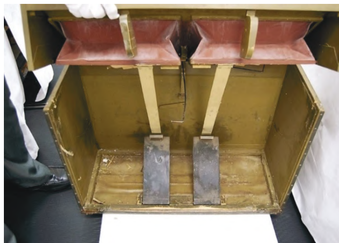
Chaplain's Field Organ before conservation treatment.