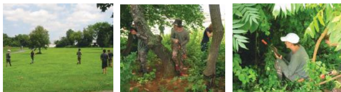
Campers practice teamwork and exercise leadership skills on patrol looking for signs of OPFOR activity on the Army Heritage Trail.

The campers engaged in a hands-on educational program to learn about military service through activities based on Infantry training manuals from the 1980s. Conducted on the Army Heritage Trail using the living history facilities, the campers engaged in realistic drills and exercises in a simulated tactical environment. Through a series of exercises and games, campers learned teamwork, problem solving, and leadership and planning skills, while learning about Infantry tactics of the late Cold War period.