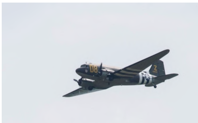
The Douglas C-47 roars overhead while paratroopers of the 506 th PAR prepare for a jump into D-day as part of the Army Heritage Days program at USAHEC.