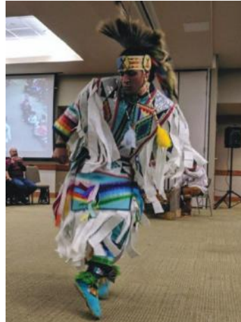
A Traditional Native American Dancer of the Red Blanket Group performs before a packed house at the 2018 Native American Heritage Month event.