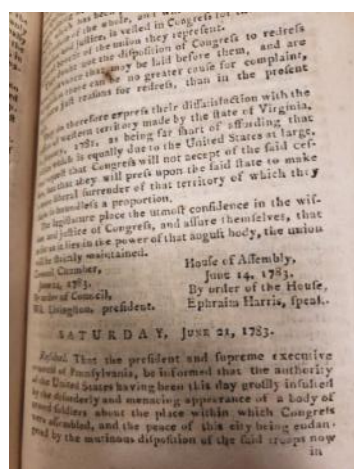
Title page and proceeding of June 21 referencing the mutiny.

small number of libraries, that comprise the Library's rare book collection. Much of this collection has been closed to research since late 2017 upon the discovery of mold and was also uncatalogued and unsearchable. After the mold was remediated and the materials were cleared for release back into the Library collection, they developed a plan to catalog and process approximately 1,800 previously uncatalogued items in addition to the existing collection so the entire rare book collection will be searchable and available for use by visiting researchers. It is a tremendous effort that will greatly enhance access and research capability.