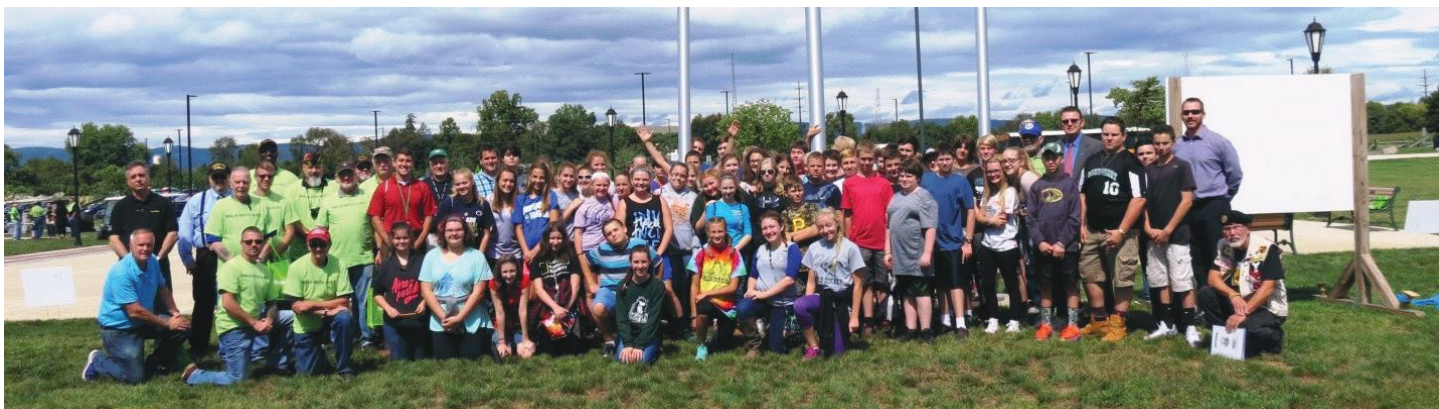
West Perry Middle School Students with veterans at the Walk With a Veteran Event.