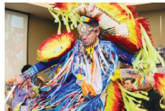
A member of the Red Blanket Drum and Dance Troupe performs a Native American dance during their presentation spanning dances and songs from all over the North American continent.

In February, USAHEC welcomed over 200 reenactors to present their historical impressions at the 9 th Annual Reenactor Recruitment Day. The event featured reenactors representing military history eras spanning from 17 th Century Pikemen to a Desert Storm Medic, including adversary Soldiers. The lunchtime presentation was martial music from the Carlisle Town Band. More than 300 visitors attended the event, and there were fabulous discussions between visitors and historical figures of all eras.