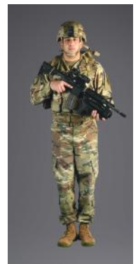
Reenactor photos of a World War I Frontline Infantry and Current Operations Soldiers for the DoD project.