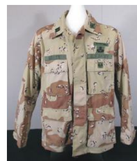
Chief of Staff Uniform of General Milley and Uniform Worn By General Milley - Multinational Force and Observers (MFO)