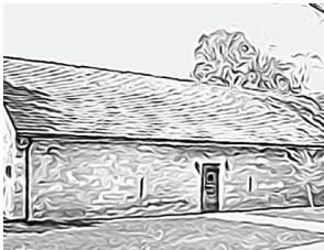
Powder House at Washingtonburg; Today's Hessian Powder Museum

If you support the Foundation's mission and programs and you would like to help see that they continue into the future, please consider joining The Washingtonburg Society . The Society recognizes individuals who have documented their intent to support the Army Heritage Center Foundation in their will or estate. Their gifts will support the growth of the Foundation's endowment to facilitate and enhance our support of USAHEC in the years to come.