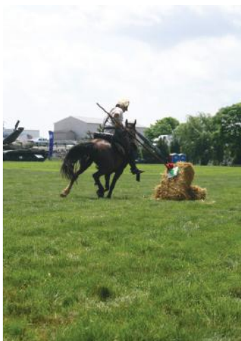
Revolutionary War-era Mounted and Dismounted Light Dragoons demonstrate drill and field tactics by lancing hay bales and sabering cabbages.

have displays and exhibits throughout the event. This year, we are also featuring displays from historical organizations from around the region. Of course, we will also have an operational Sherman Tank just to spice things up a bit.