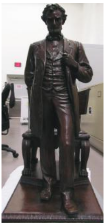
"Standing Lincoln" Sculpture, by Augustus Saint-Gaudens, 1911.