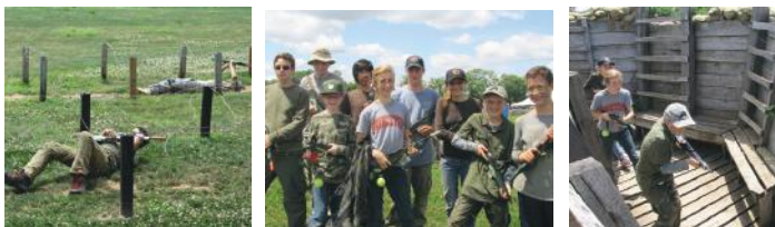
Campers develop a sense of camaraderie while developing their teamwork and leadership skills in a series of challenging and fun training drills and free-form exercises.

The VETERANS' CAFE reached out to new audiences, visiting regional nursing homes in Franklin and Perry counties, thanks to support provided by the Foundation for Enhancing Communities. We visited Premier at Perry Village for Veterans Day, where we met with bed-ridden veterans and presented commemorative pins to Vietnam, Korean War, World War II, and Cold War veterans. Shortly before Christmas, we also visited veterans at Luther Ridge elder community in Chambersburg and conducted two Vietnam Veteran Commemorative Pinning ceremonies at nearby Traditions of America. In June, the Foundation will host a D-Day commemorative event at USAHEC, with complimentary breakfast and a wreath laying ceremony at the new D-Day exhibit here onsite. Veterans' Café events are free and open to veterans of all eras and service branches, as well as their friends and family. For more information about the Veterans Cafe program or to see our schedule of events, please visit www.vet-cafe.com .