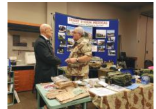
A reenactor depicting a U.S. Army medic from the Desert Storm campaign, along with a mock-up of an aid station, chats with a Civil War era reenactor at the 9 th Annual Reenactor Recruitment Day in February at USAHEC.

Thanks to a large-scale digitization project now underway, USAHEC will make its important, immense historical collection available instantly and easily to Army leaders, educators, veterans, students, and researchers anywhere in the world. Access the keyword searchable online system, by visiting https://ahec.armywarcollege.edu and clicking on "Explore." Please note - As a component of the project, we introduced a new content management hosted system, and we are soliciting feedback for the interface and search functions. We are still developing the interface of the search engine, and we want user input! This is one of the reasons we built in a Search Tips component in the menus, why we placed "Ask us a Question" right up front, and why we included a User Survey. The input we receive from users will help us refine the system and make our materials more accessible and user friendly.