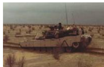
M1A1 Abrams Tank in motion during Desert Storm.