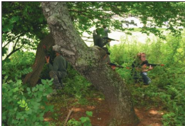
Campers secure an objective after a raid on the Army Heritage Trail. The requirement to maintain 360 degrees of security at all times during tactical exercises helps campers develop situational awareness and to pay attention to detail.

Over 1,000 student, teachers, and parents attended the 2015 NHD in PA State Contest at Millersville University. More than 100 historians, educators, and community members donated their time to judge or volunteer for the contest. Sixty outstanding students were selected to represent Pennsylvania at the National Contest in June at the University of Maryland at College Park. Of the 36 projects that went to nationals, 11 reached the final round. When the final results were announced, PA students had claimed three 2nd place wins and two 3rd place wins. All in all, PA students made up 2% of the students attending the contest, yet brought home over 9% of the medals, an outstanding achievement by any measure.