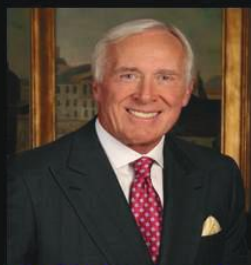
BG (R) Peter Dawkins, Heisman Trophy Winner and Rhodes Scholar