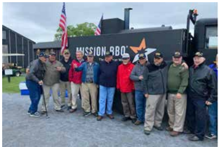
Unseasonably cold weather does not stop Veterans, they just grab their winter coats and drive on. Here, some of the Veterans pose with Humana representatives in front of the Mission BBQ 2 1/2 ton truck.

The VETERANS' CAFÉ program continues to offer Veterans opportunities to meet and share their stories with friends and families. Over the Memorial Day weekend, we held a Watchfire event on the Army Heritage Trail. Over 70 Veterans, friends, and family members attended, representing conflicts from World War II to the Global War on Terror. Together, they braved unseasonably cool weather to enjoy a barbeque dinner hosted by Mission BBQ and Humana.