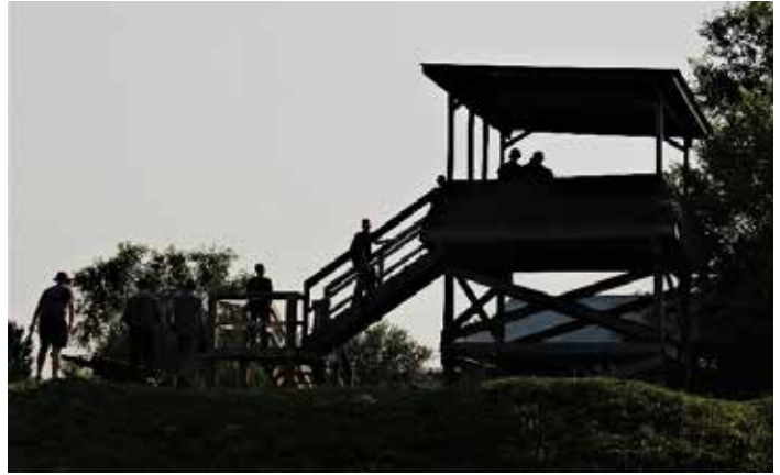
Campers making plans prior to the start of a free-form game.