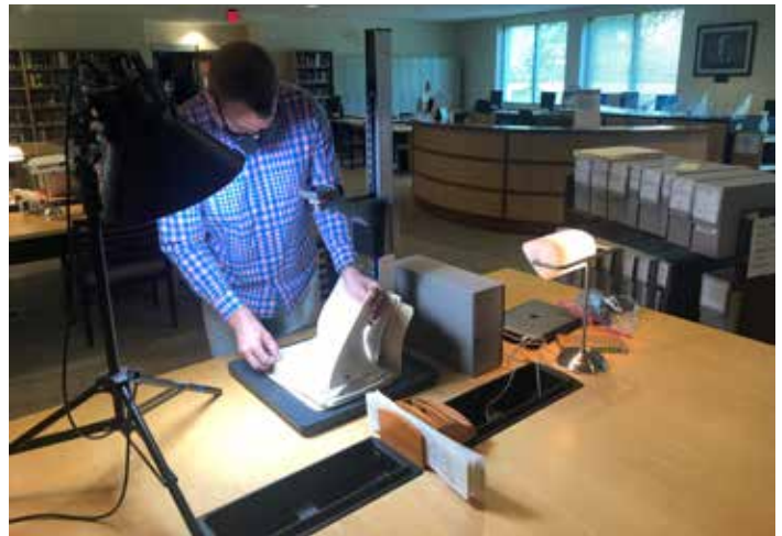
Ridgway Scholar from the Naval Postgraduate School prepares archival document for photos.

Patron Support has begun to receive USAWC student researchers at both Root Hall and Ridgway Hall. Additionally, Ridgway staff are working with the Collections Division to achieve a reordering of the archival collections that will improve access and efficiency in retrieving materials for patrons in the future.