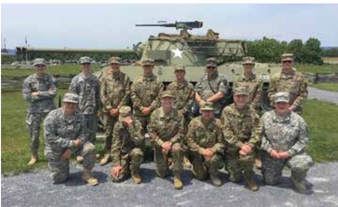
Cedar Cliff High School JROTC students with the M-18 Hellcat on the Army Heritage Trail.