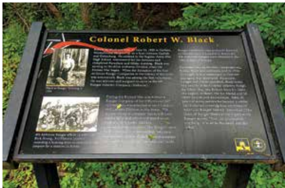
Refreshed Army Heritage Trail signage