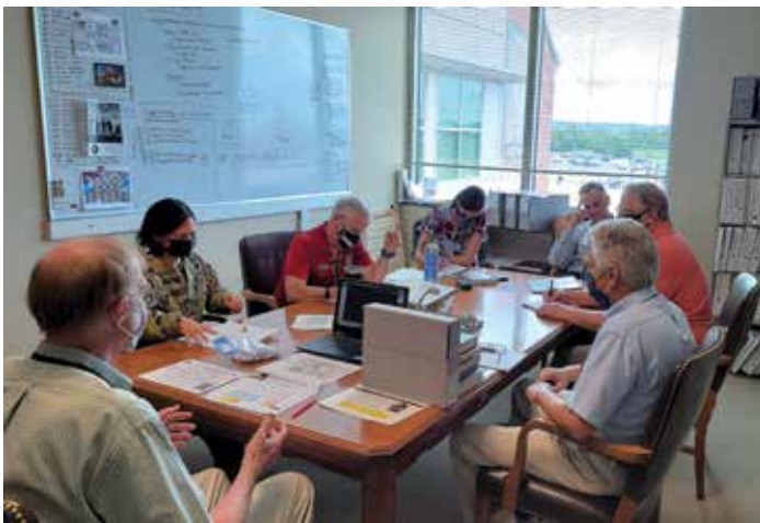
Staff members meet to discuss current research projects.