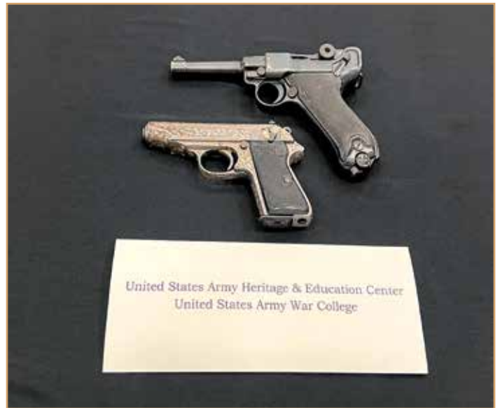
The pistols today, awaiting conservation review.