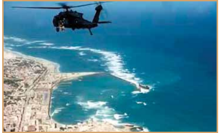
Our Spring workshop will prepare teachers to discuss the Battle of Mogadishu with their students in time for the 30th anniversary of this significant but often overlooked action.

Recent TEACHER WORKSHOPS included a look at the evolution of atomic warfare and exploration of the U.S. Army's role in the liberation of Nazi death camps. The hybrid format allowing online and in-person attendance has expanded our reach. Our most recent workshop on the Holocaust drew registrants from Texas and Illinois. Upcoming teacher workshops include: Black Hawk Down and the Mission to Feed Somalia on May 12, National History Day in Pennsylvania on September 8, and Silent Warriors: U.S. Special Forces in American History on October 27.