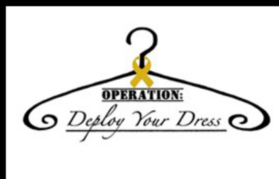
Boots on the Ground Awardee Operation Deploy Your Dress