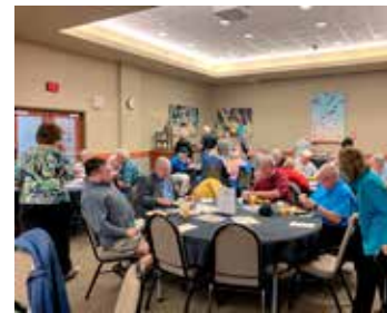
LEFT: Veterans, friends, and family gather at the Watchfire for fellowship and to honor absent friends. RIGHT: Veterans' Café breakfasts are an opportunity to share quality time with friends and hear stories of service.

Foundation, M&T Bank, Hoffman Funeral Home, Humana, United Concordia, G.B. Stuart Charitable Foundation, and Walmart for their support.