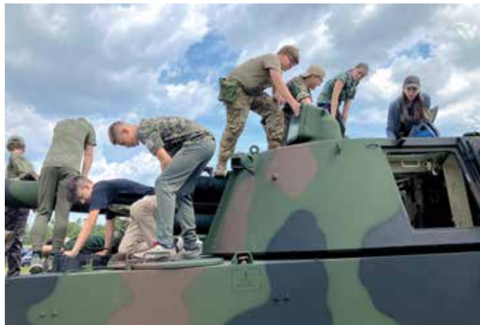
ABOVE: Youth Leadership Academy students get an up-close look at Army equipment. BELOW: Trust-Walk, students learn how to give instructions and build trust by guiding their blindfolded teammates through the exhibits on the Army Heritage Trail.