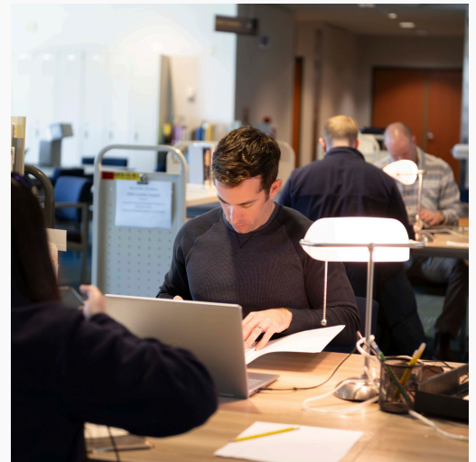
CGSC Art of War Scholars 12 Art of War Scholars doing in-depth research in the Ridgway Hall library.

More recently, 12 students from the Command and General Staff College's Art of War Scholars program at Fort Leavenworth, KS visited USAHEC on February 14 for in-depth research on commander-personalities assigned individually to them for the German Ardennes Offensive. Teammates from our Ridgway Library Branch provided in-depth research support to each student and pulled materials so the students could maximize their time in Ridgway Hall.