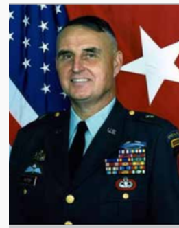
Brigadier General Dick Potter

It is through the example of these Great Ones that my colleagues at our Foundation have built an organizational culture that values the following characteristics: