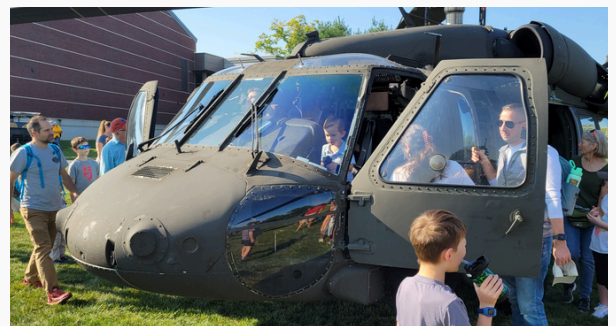
Army Expo 24 visitors explore a Pennsylvania Army National Guard UH-60 Blackhawk.

Planning for our fan-favorite event, Army Expo 2025, is well underway in planning. We seek to build on the success of the 2024 event, when more than 7,000 guests were able to experience Army history, including Golden Knights parachuting into USAHEC. As part of the event, over 300 reenactors filled the Army Heritage Trail and were joined by a wide array of active duty, Army Reserve, and Pennsylvania Army National Guard assets. Army Expo 2025 is scheduled for September 13 and 14 and promises to be bigger and better than ever.